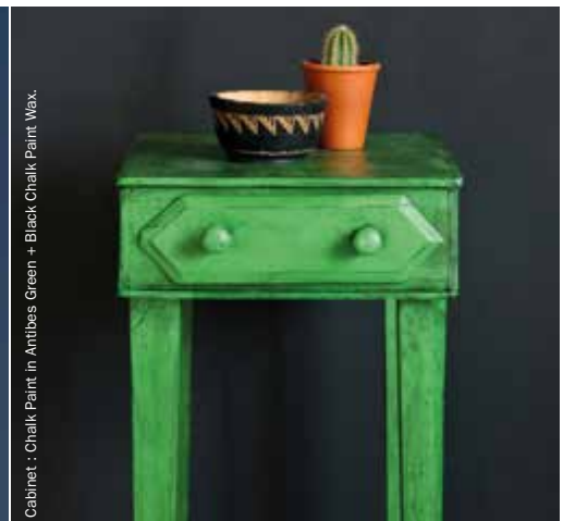
Cabinet : Chalk Paint in Antibes Green + Black Chalk Paint Wax.