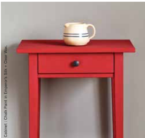
Cabinet : Chalk Paint in Emperor's Silk + Clear Wax.

Tip To remove excess coloured wax, use a little Clear Chalk Paint Wax on a lint-free cloth and rub away.